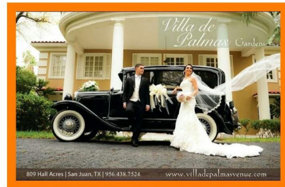
Building that a family in McAllen, Texas has allowed the church to use rent-free.

Misión Conroe will be assisting the new church with media material, marketing materials, and with organization of the new church.