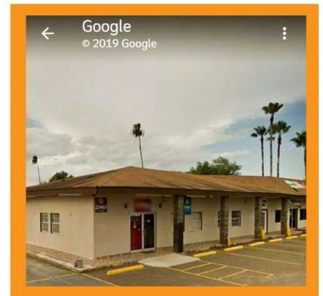
Building that the project planned to rent in 2010.

Misión Reynosa continues to be a great meeting point for people in the city as well as for those who live in McAllen Texas, although this has now been affected by the time of crime that Reynosa Mexico is experiencing.