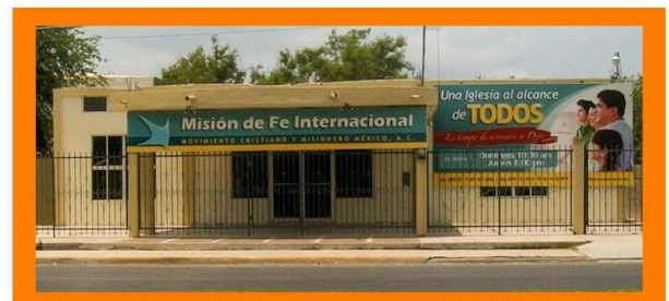
Misión Reynosa in Reynosa, Mexico.